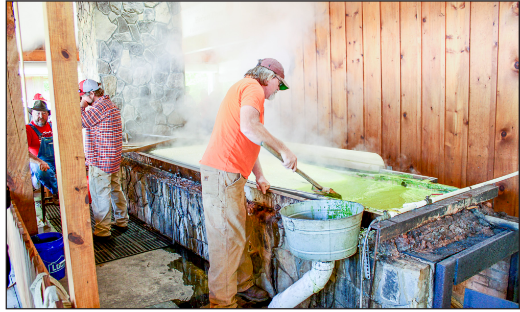
The big wood-fired pan inside Meeks Park will be cooking up sweet sorghum syrup over the next two weekends.

Then there's the live music aspect of the festival showcasing plenty of local talent for people to enjoy over both weekends, plus the other traditional games like Rock Throwin' and Log Sawin', not See Sorghum Festival, Page 2A