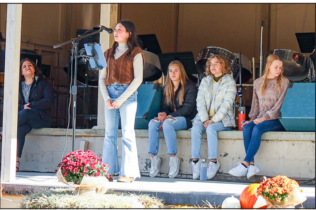
Student vocalists from Woody Gap were just a few of the many entertainment aspects of the 2023 Indian Summer Festival