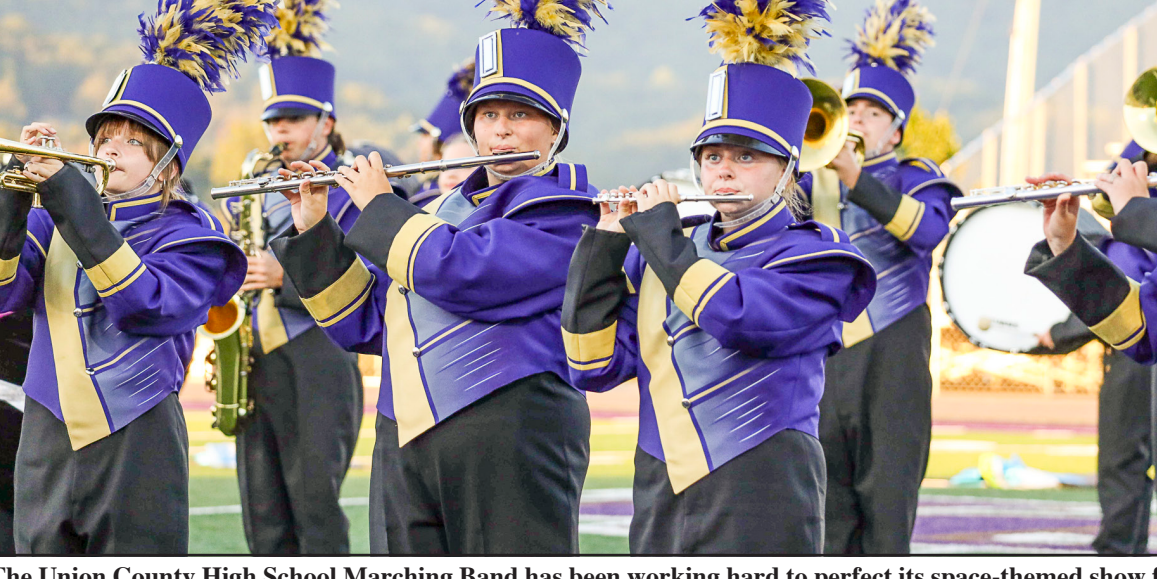
The Union County High School Marching Band has been working hard to perfect its space-themed show for competitions.